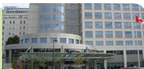
North York General Hospital

Greening Health Care recognizes member hospitals that stand out in terms of energy savings achieved and how they are working to implement their conservation plans.